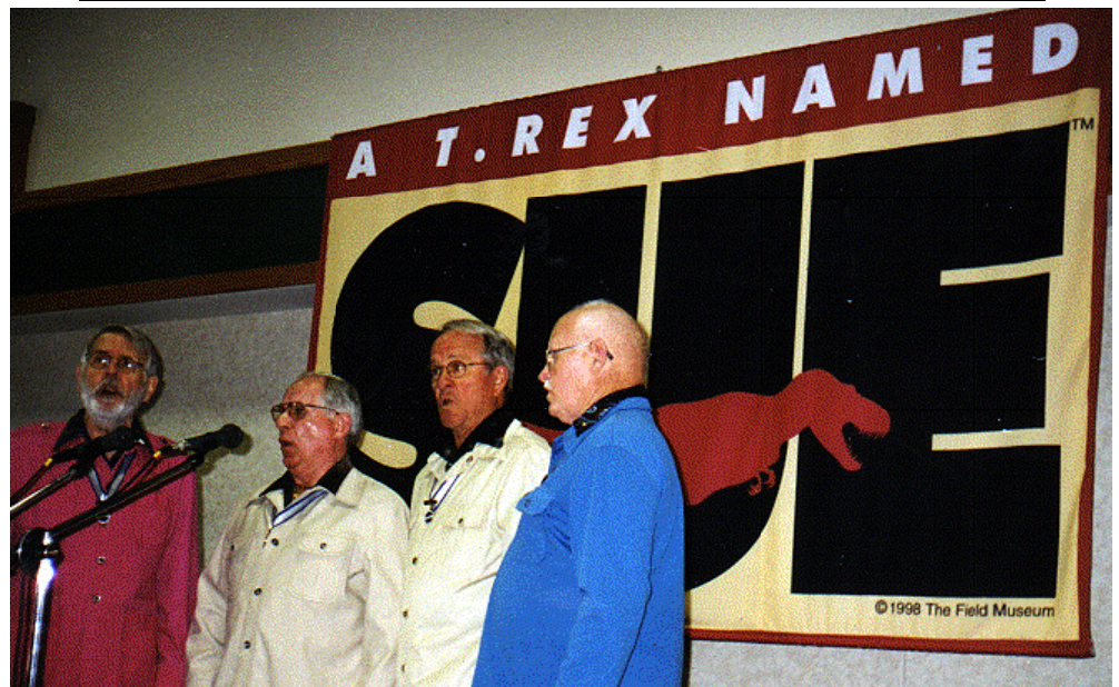
Jurassic Larks at the Sternburg Museum in Hays, Kansas. They must have been singing "If You Knew Susie".